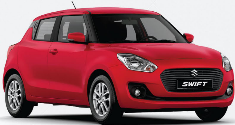
Fire Red Sld. (Z4Q)