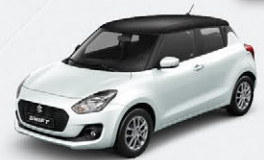
Arctic White / Black Roof