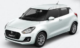
Arctic White Premium (ZHJ)