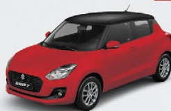
Fire Red / Black Roof