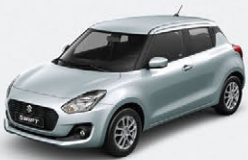
Silky Silver Metallic (Z2S)