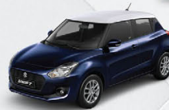
Midnight Blue / White Roof