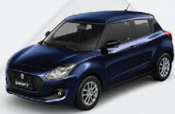
Midnight Blue Premium (Z1Q)