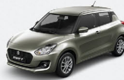
Magma Gray Metallic (Z7Q)