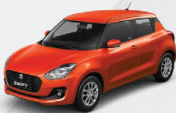
Lucent Orange Metallic (ZYE)