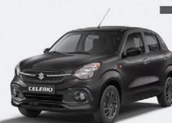
Midnight Black Pearl (ZAM)