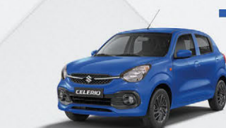
Speedy Blue Metallic (WAJ)