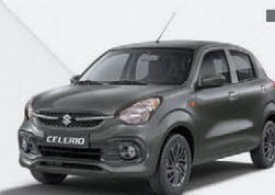
Glistening Grey Metallic (ZNZ)