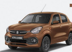
Caffeine Brown Pearl (ZTL)