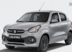
Silky Silver Metallic (Z2S)