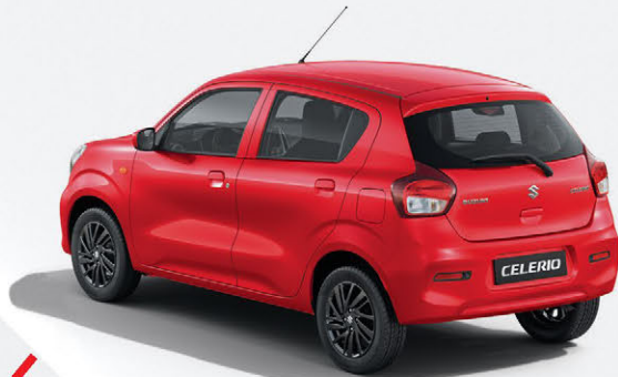
Fire Red (Z4Q)