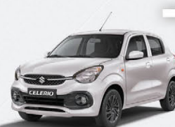
Artic White Pearl (ZHI)