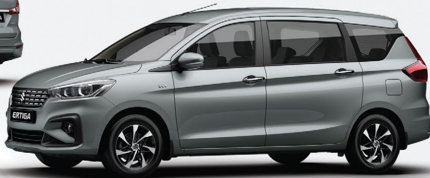
Magma Grey Metallic (Z7Q)