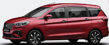
Auburn Red Premium (ZYY)