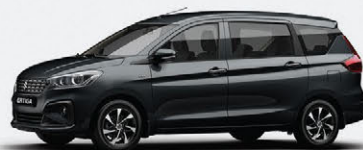
Midnight Black Pearl (ZAM)