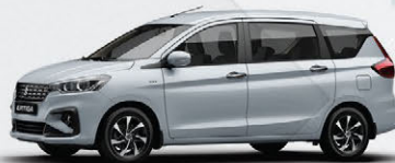
Arctic White Pearl (ZHJ)