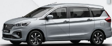
Silky Silver Metallic (Z2S)