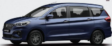
Oxford Blue Premium (ZYA)